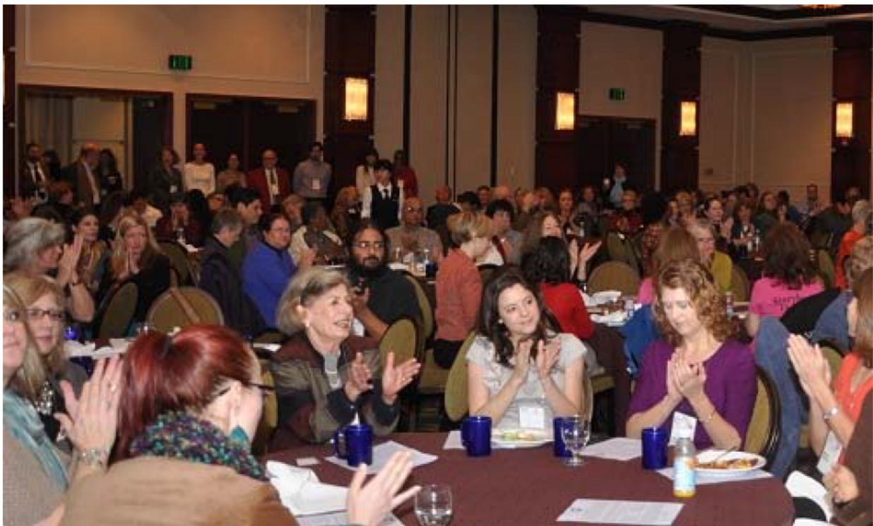
Participants at the 2013 State of the Arts Conference

Happy 2015! With the new year, the Texas Commission on the Arts is rolling out a new monthly newsletter! We hope you'll find it helpful and informative. We'd appreciate your feedback to help us keep the newsletter useful to you.